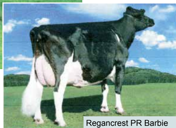
Regancrest PR Barbie