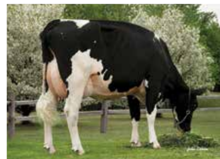
Ralma Christmas Fudge-ET (1) VG88 LA 1 4th Dam